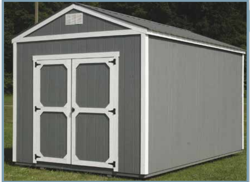
10x16 Dark Gray Paint, White Trim, with Charcoal Metal Roof