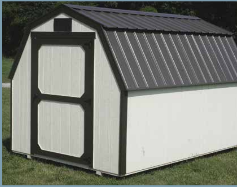
8x12 White Paint, Black Trim, Black Metal Roof

A perfect place to store outside supplies, the Barn looks attractive beside your swimming pool, by the garden, or next to the driveway. Help your children organize their bikes, riding toys, and outside games by giving them a place to keep them.