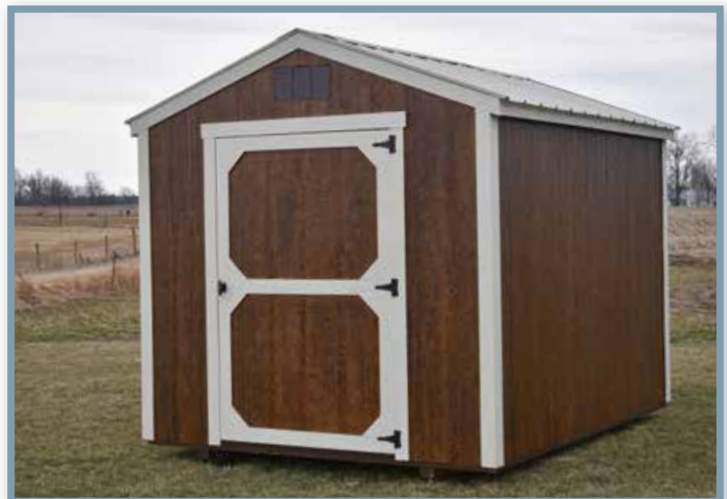
8x10 Chestnut Brown Urethane, Almond Trim, Stone Metal Roof