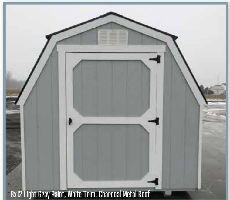
8x12 Light Gray Paint, White Trim, Charcoal Metal Roof