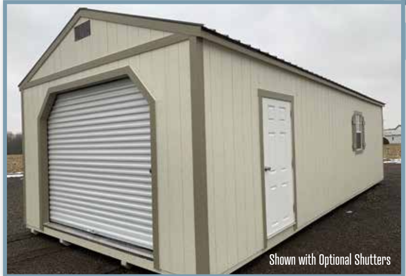
14x32 Almond Paint, Taupe Trim, Burnished Slate Metal Roof

The Garage also has a 2'x3' window and air vents that are positioned to create optimum ventilation and temperature control.