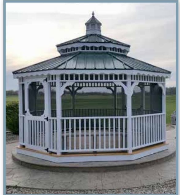
Double Metal Roof