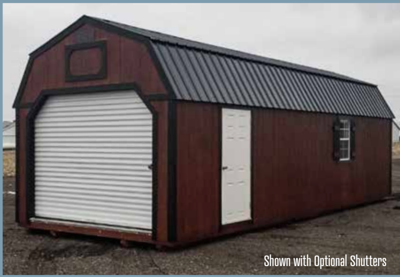
12x32 Red Mahogany Urethane, Black Trim, Black Metal Roof

Our Lofted Garage comes with a loft that gives up to 50% more storage space!