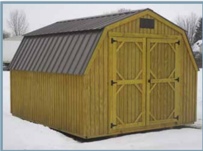
10x12 Treated Barn

All 8' wide buildings come with a 4' door. All 10' and wider buildings have standard 6' double doors.