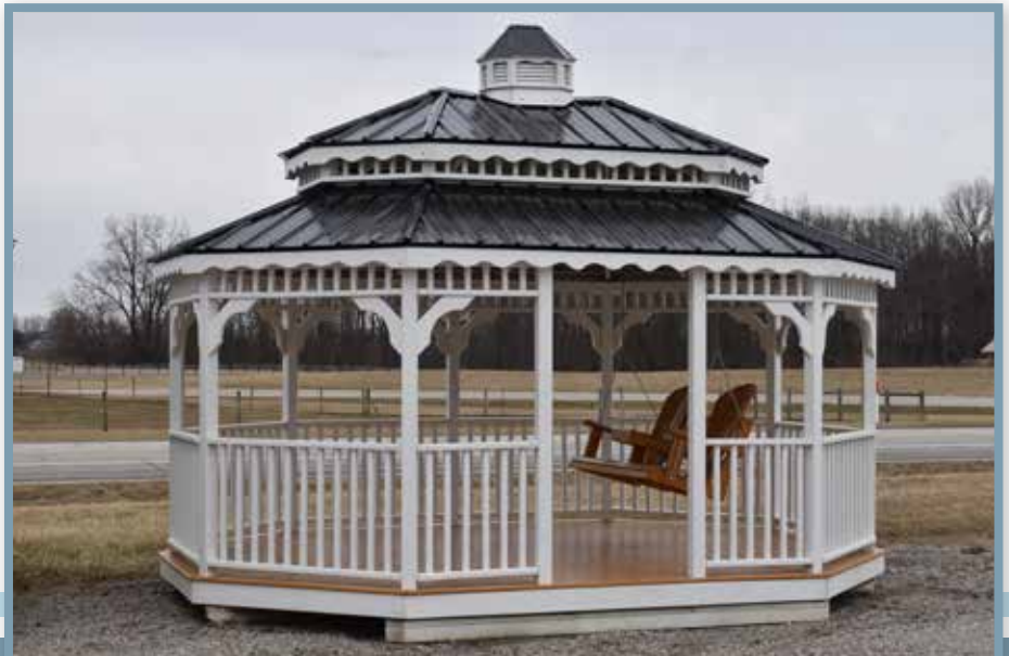
Double Metal Roof