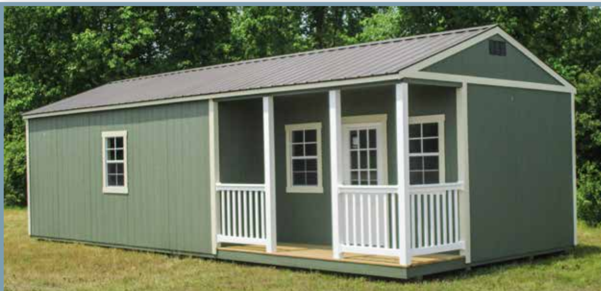
CASITA - 14x32 Olive Green Paint, Almond Trim, with Burnished Slate Metal Roof