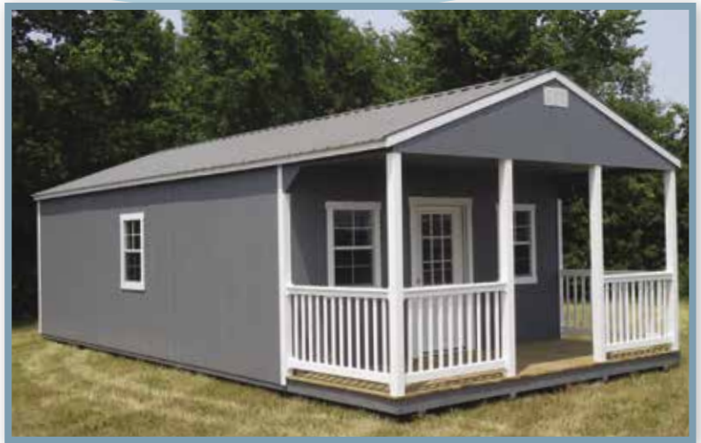
CABIN - 16x32 Dark Gray Paint, White Trim, with Charcoal Metal Roof

Do you have a plot of land that you wish to put a structure on? Homestead Barns can build and deliver you that dream building. The Cabins and Casitas make a perfect “Get-a-Way” place for you to enjoy the scenic outdoors from the comfort of the porch. Maybe you need a building to keep your lawn and garden tools. Or you may be dreaming of that nice woodworking shop in your backyard. At Homestead Barns we can customize a building to fit your need.