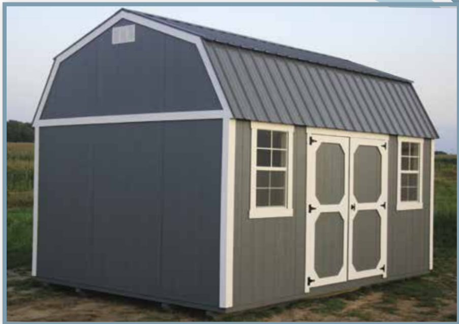
12x16 Dark Gray Paint, White Trim, with Charcoal Metal Roof

Standard features of the Lofted Garden Shed are doors on the side and two 2'x3' windows. (shutters are not available on standard door and window placement for buildings shorter than 16').