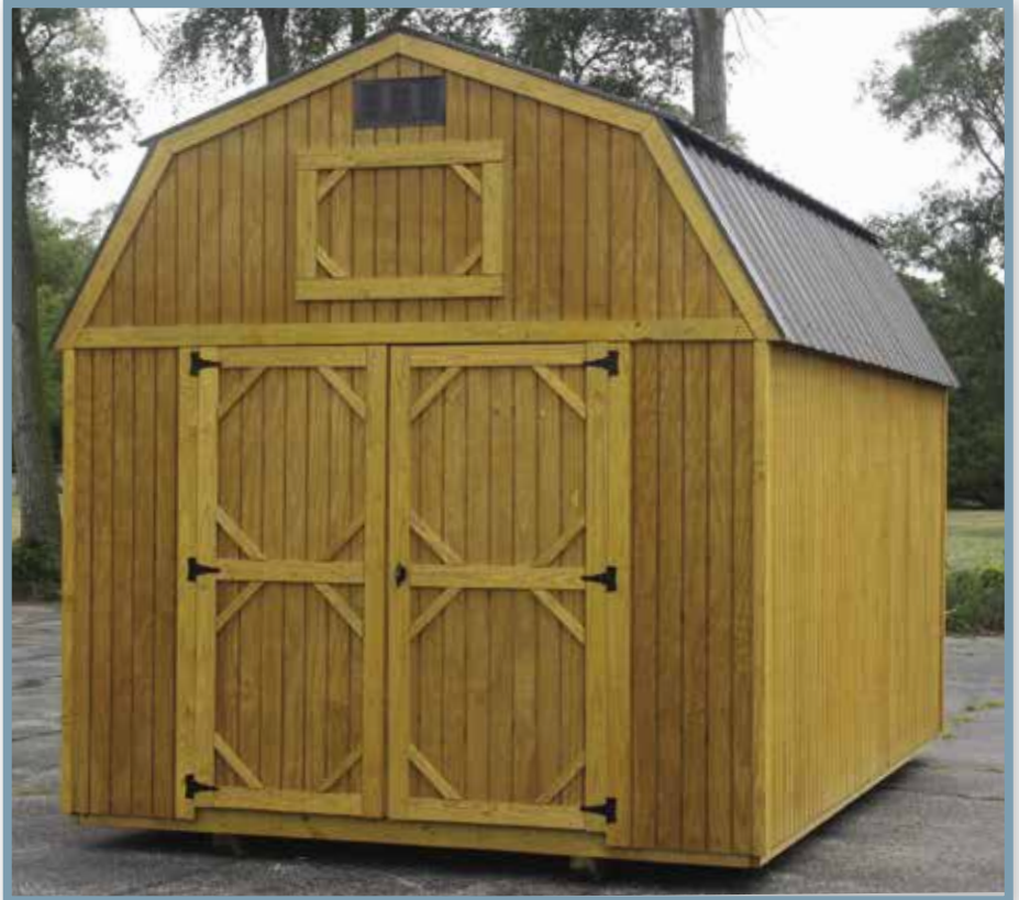
10x16 Treated Lofted Barn

We can also customize with windows or a small access door. Available in painted, treated, or urethane exterior finish. All 8' wide buildings come with a 4' door. All 10' and wider buildings have standard 6' double doors.