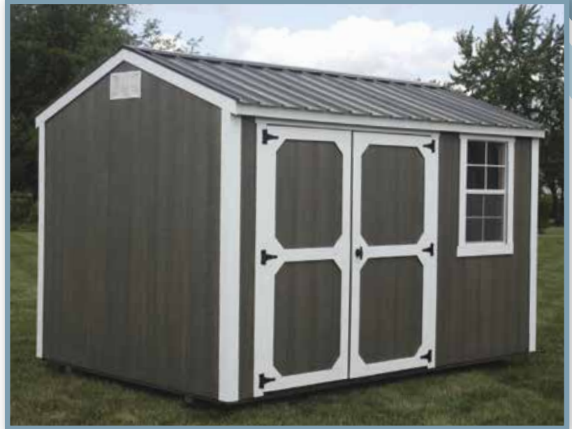
8x12 Driftwood Urethane, White Trim, Charcoal Metal Roof

The 16' long and longer have double doors in the center and 1 window on each side. (Shutters not available for standard door and window placement shorter than 16').