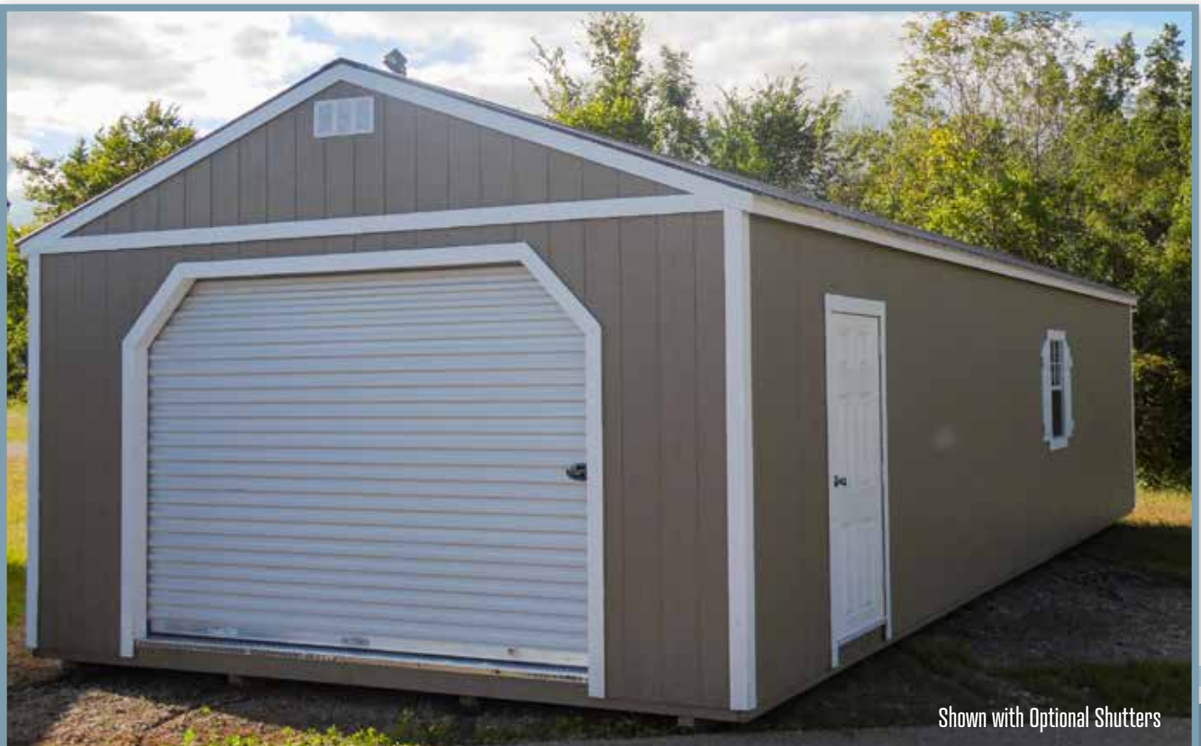
Shown with Optional Shutters