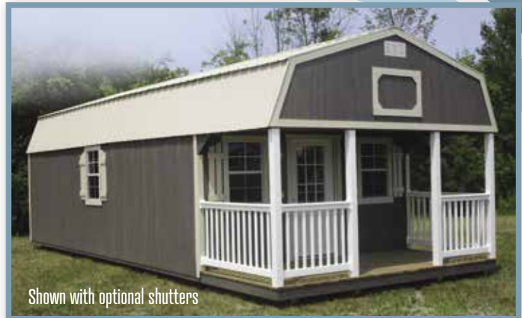
LOFTED CABIN - 14x32 Driftwood Urethane, Almond Trim, Stone Metal Roof

The Lofted Cabins and Lofted Casitas make a perfect “She Shed” or “Man Cave”. They also make a perfect place to stay when you are out on a Hunting or Fishing trip. They have an attractive porch to relax and enjoy a cup of your favorite coffee or tea. They also serve as a nice workshop in your backyard to store your yard and garden tools. Or maybe you have overnight guests and they may want their own private space. Or choose a Lofted Cabin or Lofted Casita for many more applications.