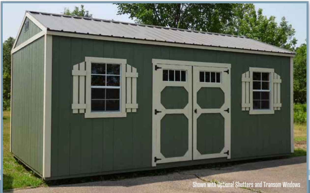
Shown with Optional Shutters and Transom Windows