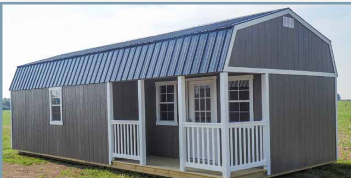
LOFTED CASITA - 14x32 Driftwood Urethane, White Trim, with black metal roof