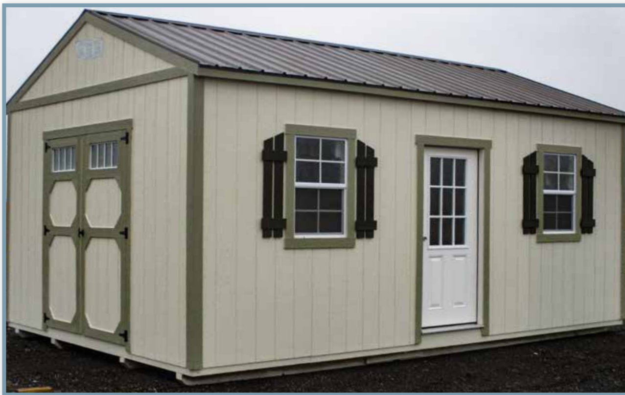
14x20 Almond Paint, Clay Trim, Burnished Slate Metal Roof

The Klassic Garden Shed will add an attractive look to your yard, while serving as a workshop for that woodworking project you have, or a place to organize your yard and garden equipment. It can also be called a “She Shed” for that yard decorating project you enjoy doing. The doors and windows can be rearranged to fit your personal need.