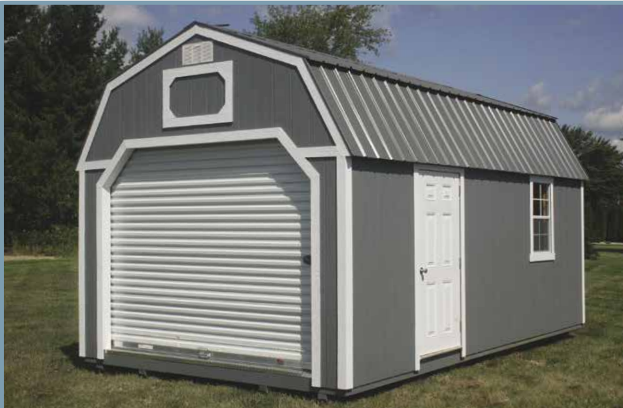
12x20 Dark Gray Paint, White Trim, with Charcoal Metal Roof

The heavy-duty floor and 9'x7' roll-up door make the Lofted Garage a perfect shop for fixing up vehicles or machinery. Or the Lofted Garage can be a home for the antique car that you want to protect from the weather.